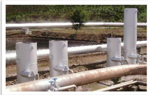
Wellhead PT. Magma Nusantara 2009