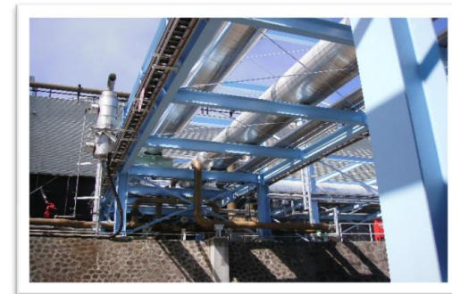
Wellhead Support PT. Magma Nusantara 2009