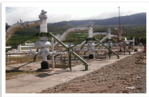
Wellhead PT. Magma Nusantara 2009