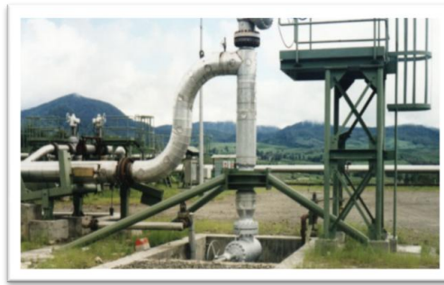
Wellhead Accesoris PT. Magma Nusantara 2004 - 2006