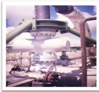
Wellhead PT. Magma Nusantara 2004 - 2006